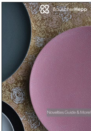
Novelties & More Digital Catalog