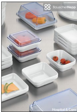
Hospital & Care