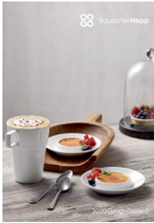
Tafelstern & WMF Design Guide