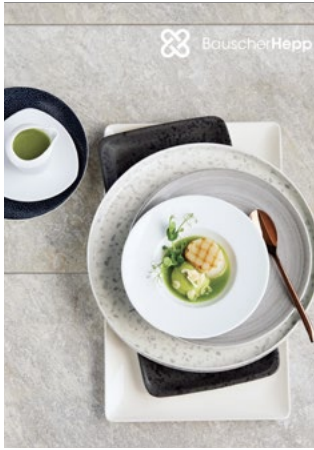
Bauscher & Hepp Design Guide